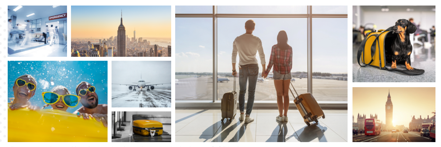
All coverages are subject to additional terms and conditions; please review the plan document for full details.