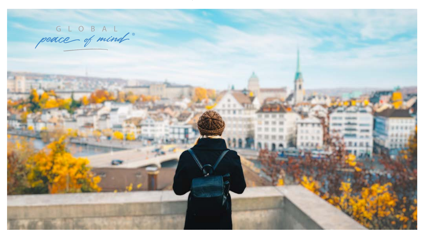
Based on your state of residence, some plan benefit names above may not match your plan documents. While every effort was made to align terminology for consistency, please refer to the sample wordings for all defined terms. Please check your plan documents for specifics.